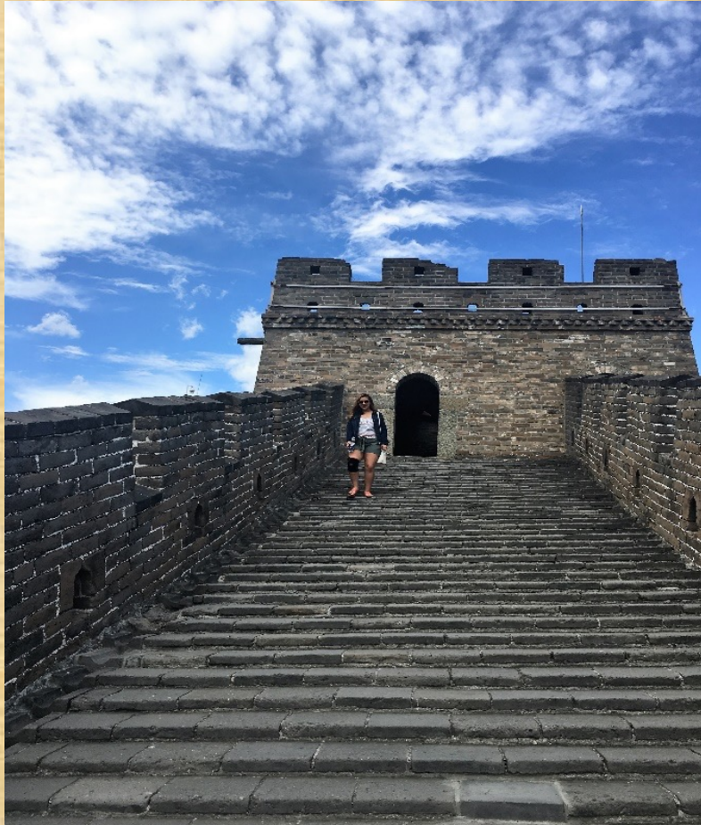
Elyzabeth Camacho, Bishop '16, China