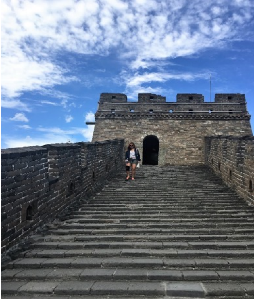
Elyzabeth Camacho, Bishop in Beijing, China

As a reminder, the program must have at least four hours daily of academic activities