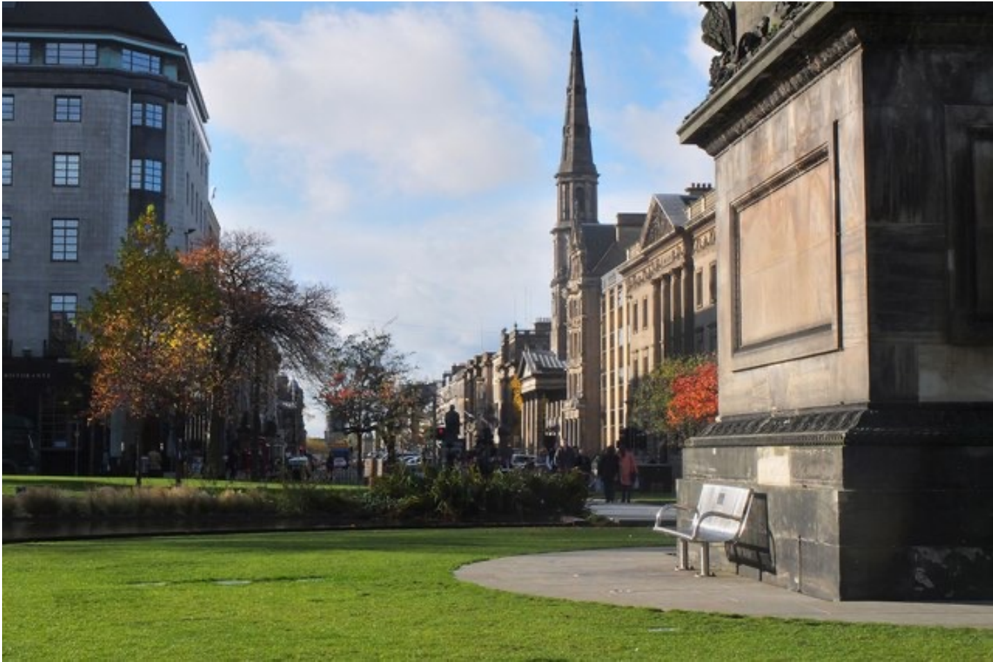
George Square (central) campus